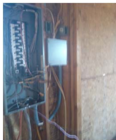
Electrical Partially completed