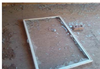
Windows are all vandalized