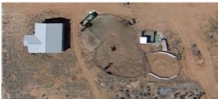
Horse fencing on site