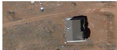
No site improvements