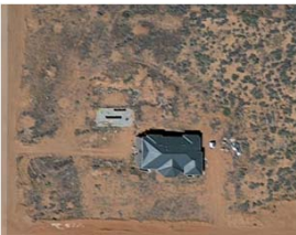
No site improvements