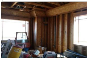
High quality interior framing

* Extensive weather damage * Some windows are missing