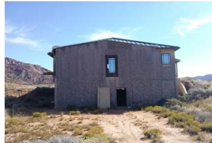
Side of building needs repair