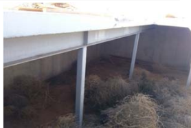
Below mechanic bay